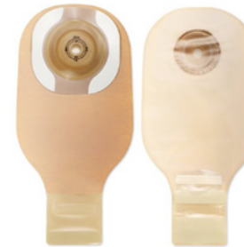
One-Piece Ostomy Pouch