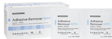
Adhesive Remover Wipe