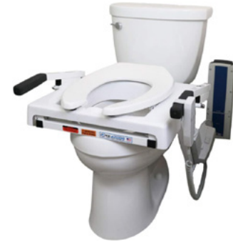
Mechanical Toilet Lift