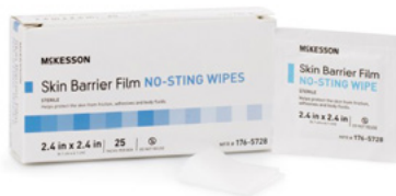
Skin Barrier Wipes