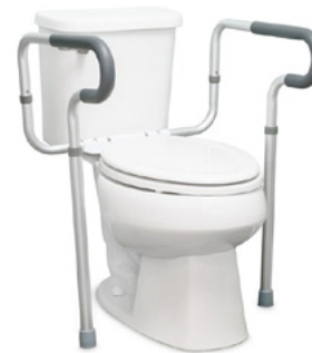
Toilet Safety Rails