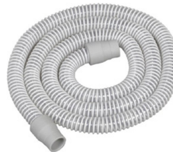
Tubing - Standard