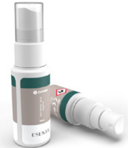
Skin Barrier Spray