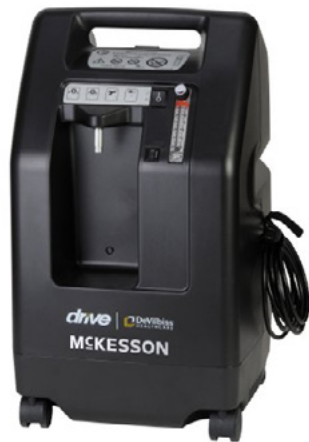
Stationary Oxygen Concentrator — Drive/DeVilbiss