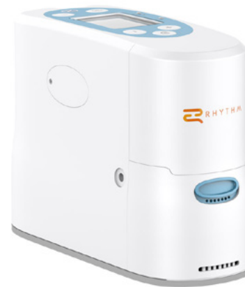
Portable Oxygen Concentrator — Rhythm P2-E6