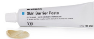
Skin Barrier Paste