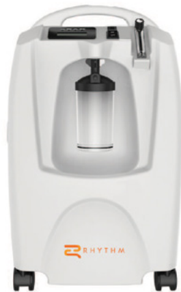
Stationary Oxygen Concentrator — Rhythm